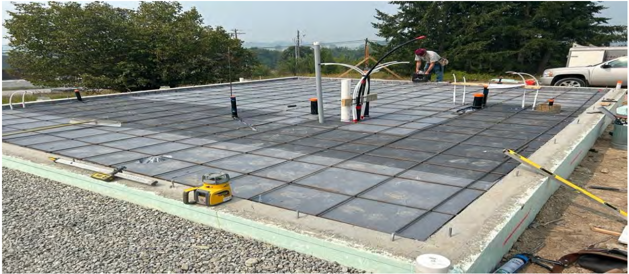
Prep for slab on grade with rebar. Plumbing, electrical and radon pipe