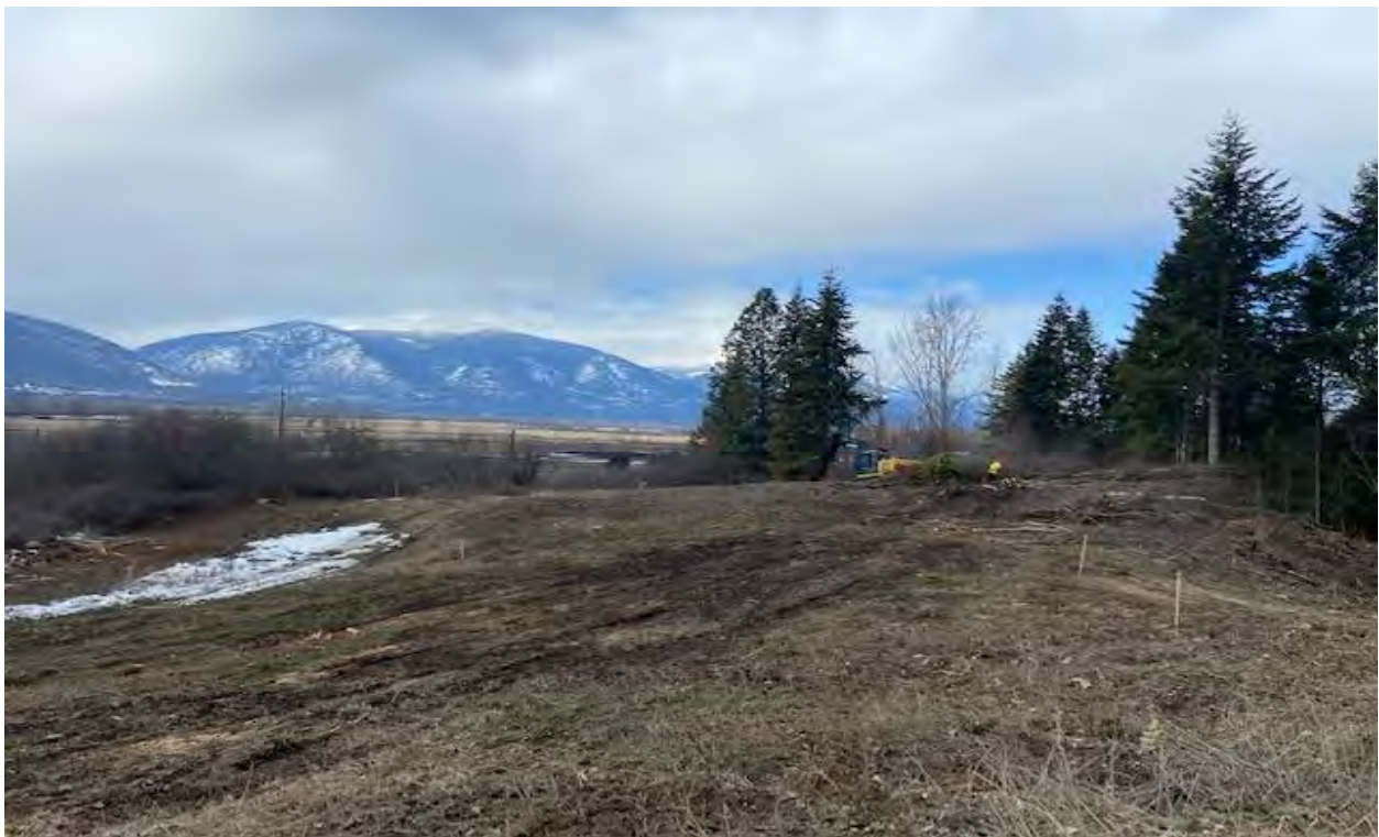
810 Mallory Road- site for the new small homes.

See photo's below on the progress so far: