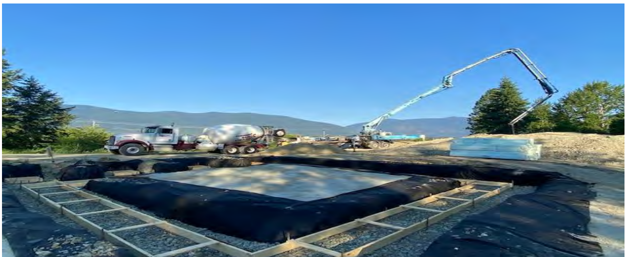
Footings prepped with rebar and ready for concrete.