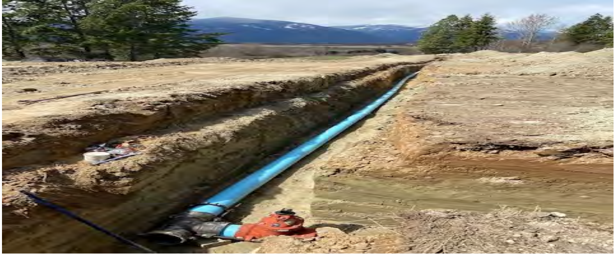
Water line and fire hydrant