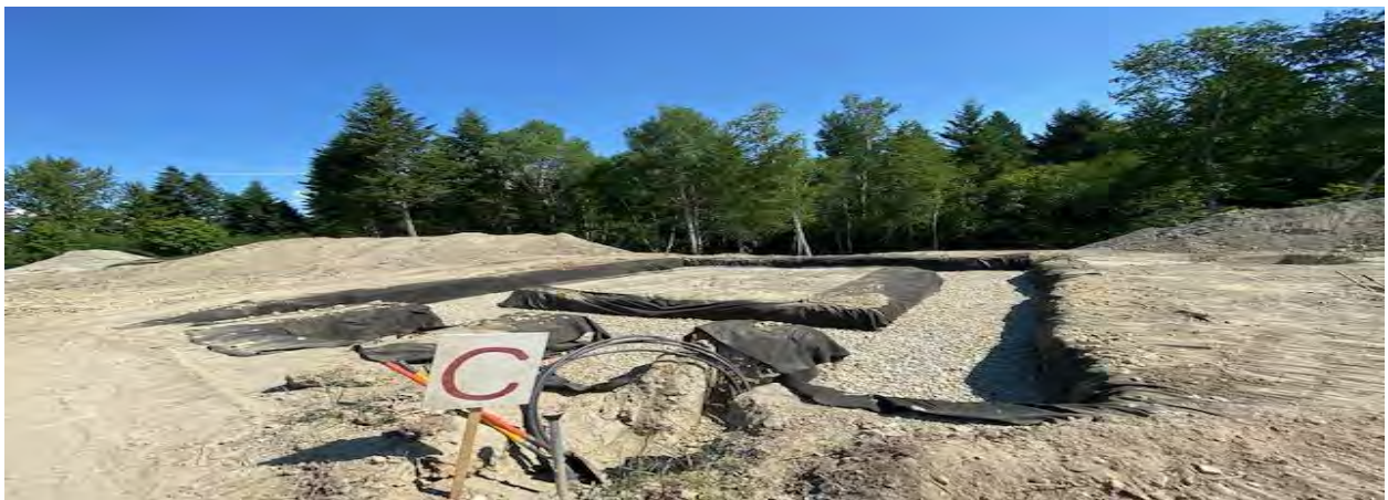
One of the homes- prep for footings.