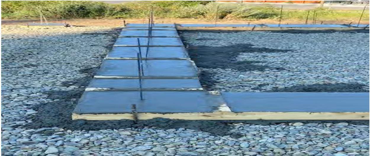
Footings with rebar. Ready for ICF wall