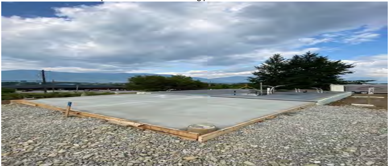
Foundation poured, and ready to start the framing in September.