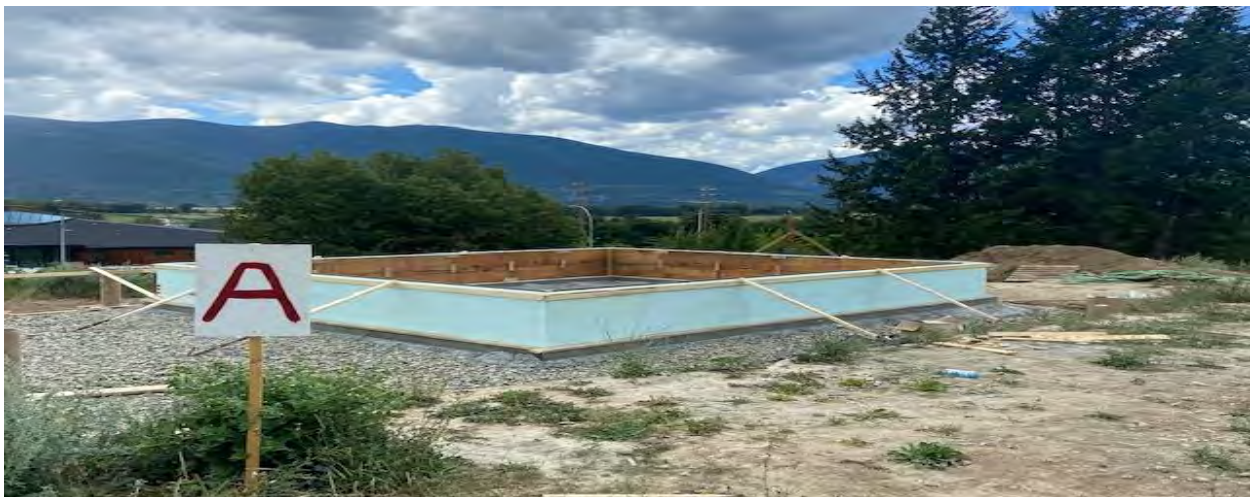
ICF wall completed.