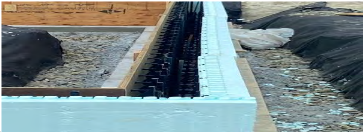
Insulated concrete forms. Hollow foam block that are reinforced with steel rebar, and then filled with concrete